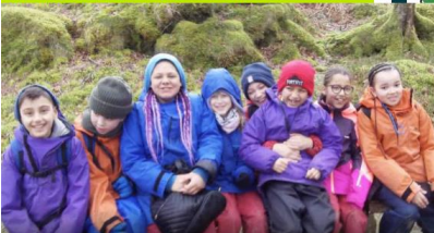
Glaramara 2020 Day 2 - Hillwalk

Welcome back to those children who attended our Glaramara residential. The children not only had a great time but they also had some great weather too – and not so great weather too! The children took part in lots of different events including orienteering, coracle building,